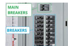
Electrical panel breakers