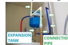
Expansion tank & pipes