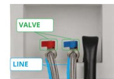
Connection valves and lines